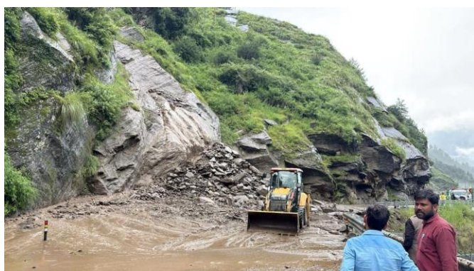
Blocked roads in Uttarakhand