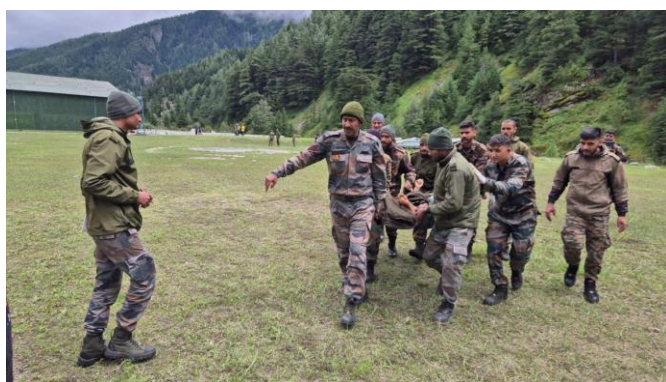
Rescue operations in Uttarakhand