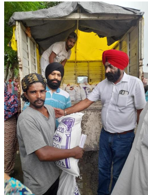
Humanitarian Agencies Distributing relief materials in affected areas