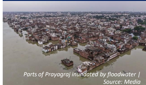
Parts of Prayagraj inundated by floodwater