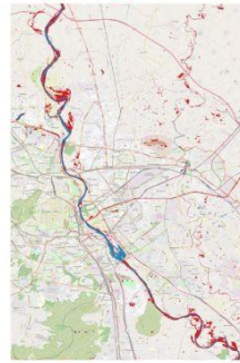
Minimal flooding seen on 30 th August 2025