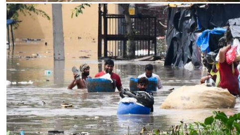
Flood Inundated Areas in Delhi