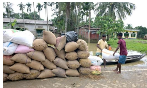
Villagers shifting their paddy to a safe place as their house is submerged by flood waters in Nagaon district of Assam on Monday, 02 June 2025