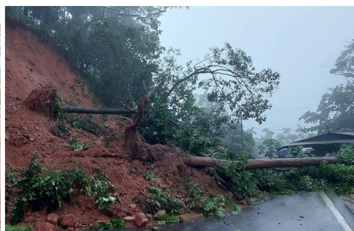
The hill near Karthoji on Madikeri - Mangaluru National Highway caved in, on May 26, resulting in stoppage of vehicular traffic