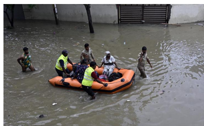
Flooded area at Sai layout in Bengaluru following heavy overnight rains