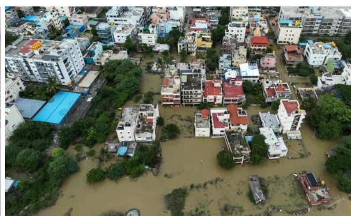
An aerial view shows a flooded locality following heavy rainfall in Bengaluru