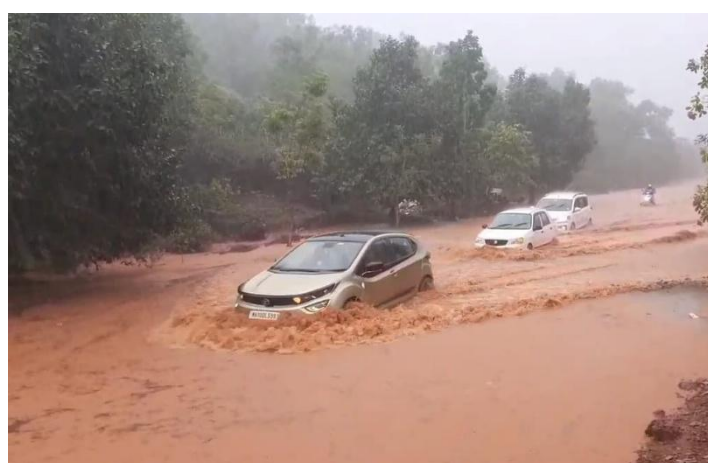
Motor vehicles navigate on a flooded stretch of State Highway 48 near Santheguli in Kumta taluk of Uttara Kannada district.