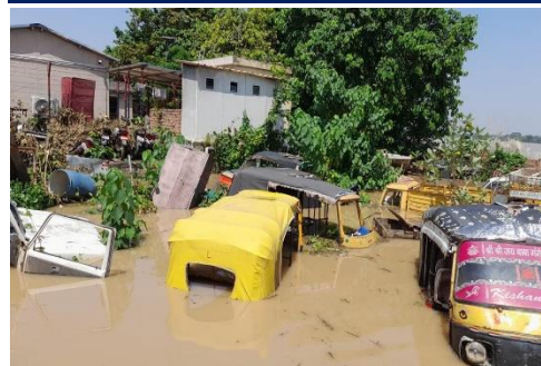
Situation in Bihar