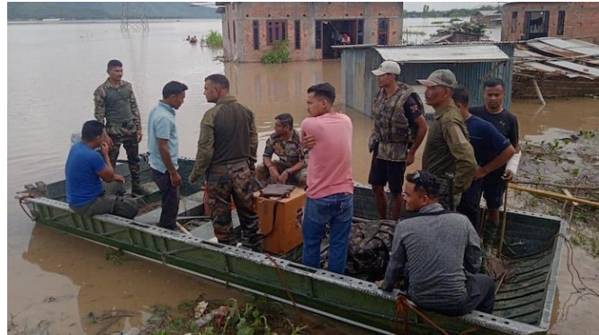
Visuals from Flood Inundation in parts of Assam and Manipur