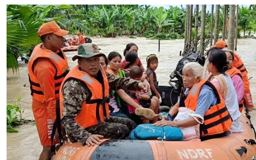
Flood Rescue in Assam