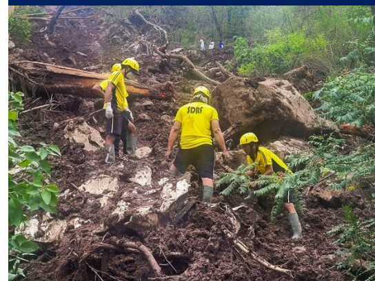
Landslide in Mizoram