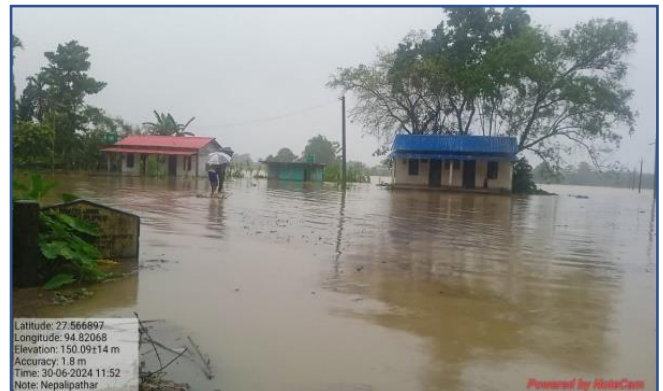
Situation of schools in Dhemaji district Assam