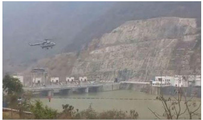
IAF Choppers sprinkling water on forest fire