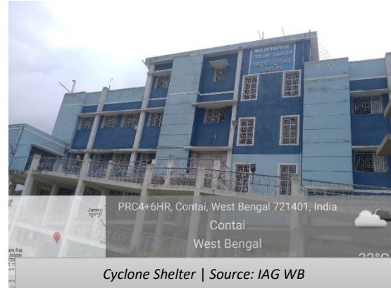
Cyclone Shelter