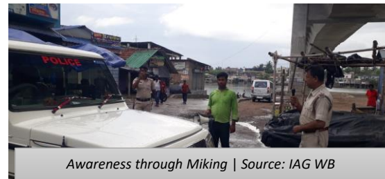
Awareness through Miking