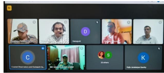
IAG – W.B 1 st meeting on 25 th May