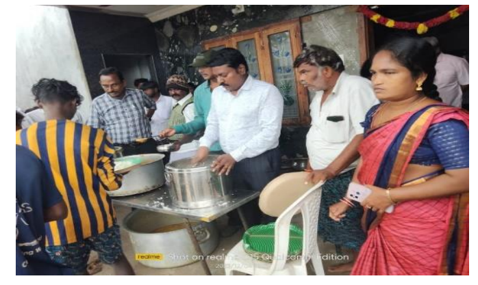
Zonnawada relief camp Buchireddypalam mandal, Nellore district