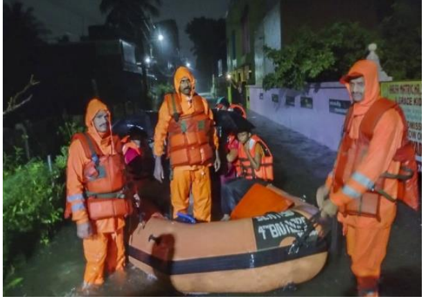
NDRF personnel evacuate residents from a flooded area