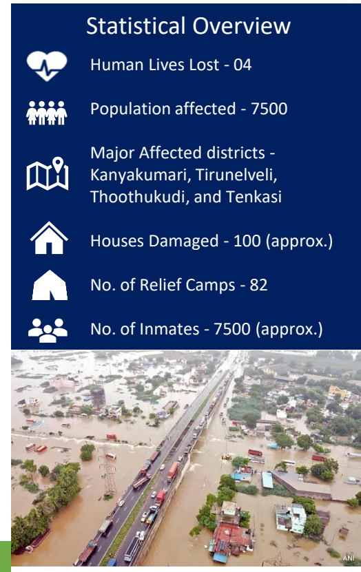
Aerial picture of flood hit areas : TN