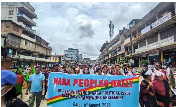
Naga Peoples Rally for Peace