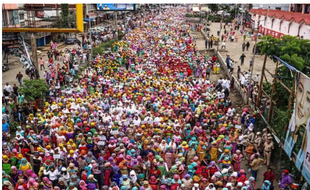
Massive Peace Rally In Manipur in Imphal