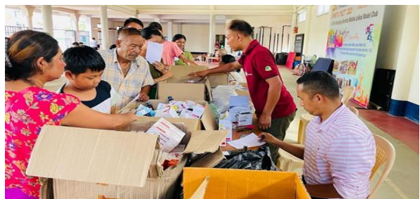
Health Check-up camp by Caritas India