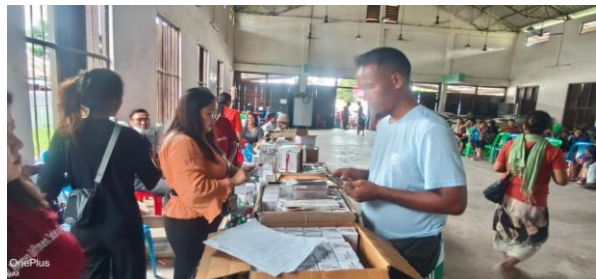
ActionAid Association are organising medical camps for women, children and families in Relief Camps