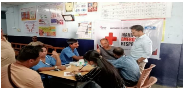
Providing Essential medical services by Doctors For You