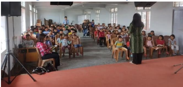
Centre for Community Initiative has implemented Inclusive Community Learning Centre (iCLC) at 7 relief camp