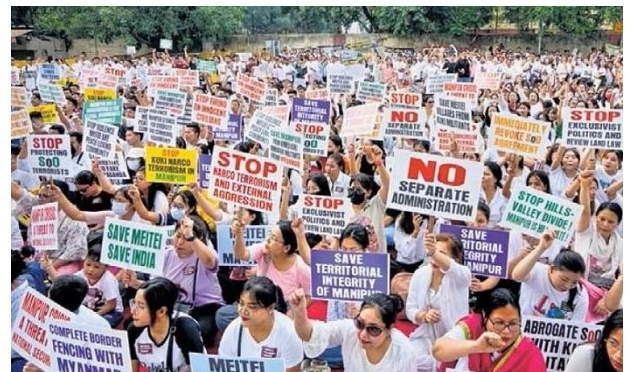
Manipuri civil society and students' organizations protest at Jantar Mantar