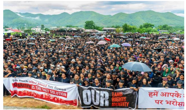
Members of the Indigenous Tribal Leaders Forum take part in a protest rally against the ethnic violence in Churachandpur