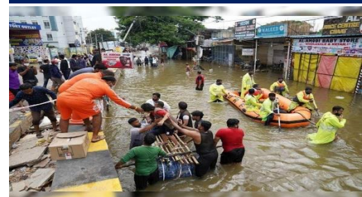
Rescue operations

No. of persons evacuated – 60,000 (HP), 18,802 (Punjab), 20,000(Delhi),