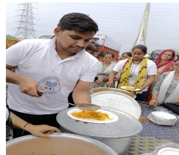
Humanitarian Agencies providing Relief materials