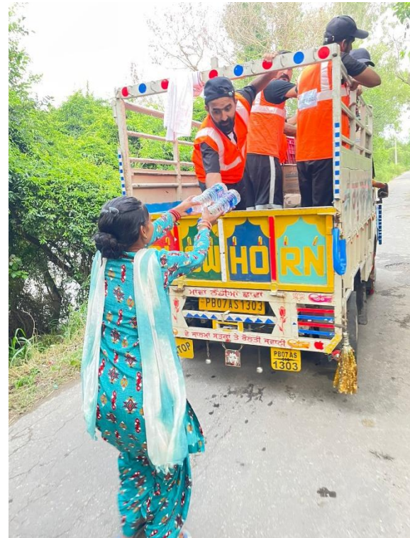
"Humanity First India" is providing relief materials