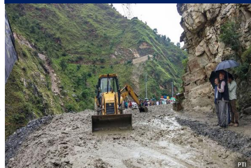
Cleaning Roads