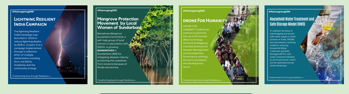
Read Best Practices here >>

Sphere India as a National Coalition along with NIDM and other partners convened INDIA RESILIENCE DIALOGUE 2022 by flagging off the Reimagining Disaster Risk Reduction Campaign on 13th October 2022. As part of the campaign, we showcased the best practices and innovative models for achieving Disaster Risk Reduction (DRR), already adopted and in use by various agencies across India through social media campaign. These stories were sourced from the Compendium of Good Practices in Disaster Risk Reduction published by Sphere India last year and will offer an opportunity for cross-learning to improve, implement and respond to various emergencies.