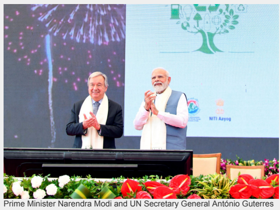
Prime Minister Narendra Modi and UN Secretary General António Guter at Mission LiFE global launch event in Gujarat on October 20.

Prime Minister Narendra Modi launched Mission LiFE (Lifestyle for Environment), in the presence of the UN Secretary General António Guterres, at the Statue of Unity, Ekta Nagar, Gujarat on October 20. First proposed by the Prime Minister at COP 26, Mission LiFE is envisioned as an India-led global mass movement that will nudge individual and collective action to protect and preserve the environment. The Prime Minister and UNSG unveiled the LiFE logo and tagline, and released the Mission Document at the event. Addressing the gathering, the Prime Minister highlighted the importance of unity in the fight against climate change.