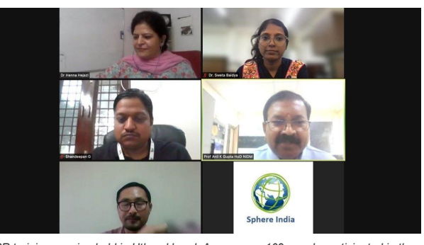
EPR training session held in Utharakhand. As many as 109 people participated in the training program.

Sphere India in association with the National Institute of Disaster Management conducted a three-day online training on multi-sector coordination for response and resilience in Uttarakhand from October 17th-19th Sectoral experts from various organizations delivered these sessions and made deliberations and provided recommendations for improvement and guidance for better performance. Stakeholders from Government and CSOs joined this training.