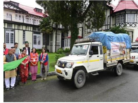
Governor flags off vehicles with relief material