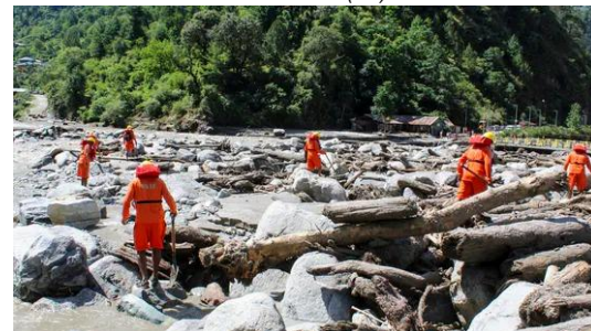
Search operation in Sainj valley of Kullu district