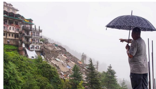
Debris of a multi-storey building that collapsed following heavy rainfall, at Bhattakrufer, in Shimla, Monday, June 30.