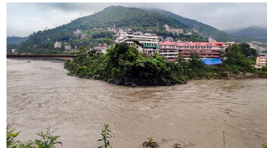
Torrential rain continued across Himachal Pradesh, resulting in flash floods