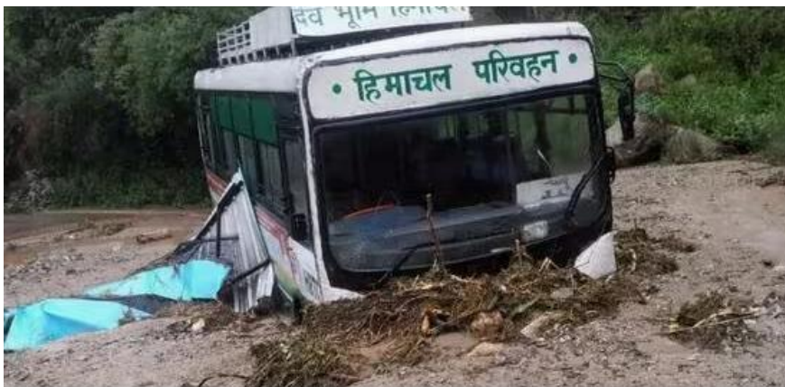
HRTC bus stuck in the mudslide on road in Mandi district on Tuesday