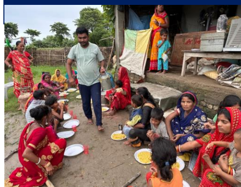
EHA's Community Kitchen in Kishanganj