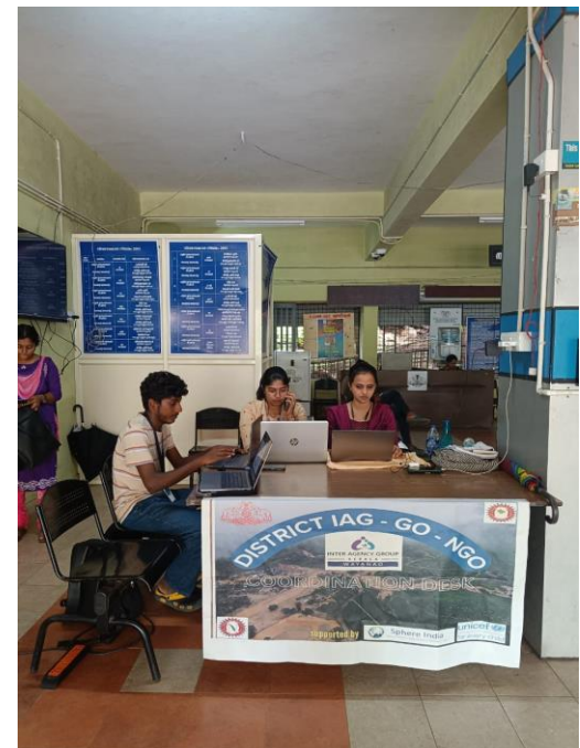
GO- NGO Coordination Desk, SEOC