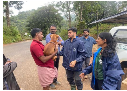
HSI assessing the situation