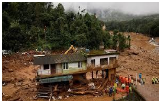
Rescue Operations in Wayanad