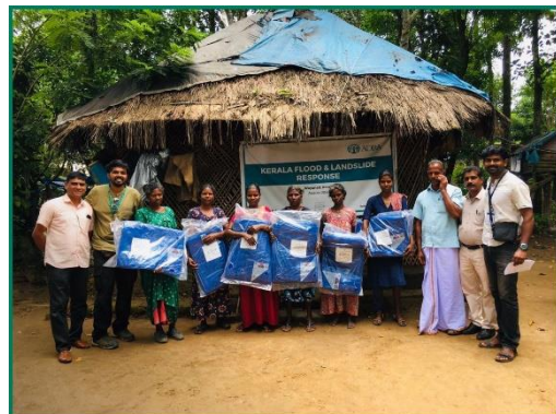
ADRA India assessing the situation