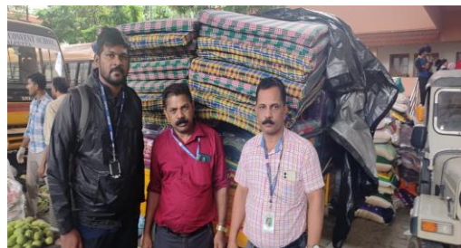
Eficor Providing relief materials