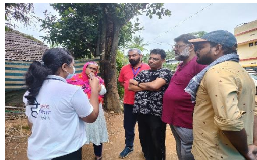
HAI engaged in appreciative enquiry