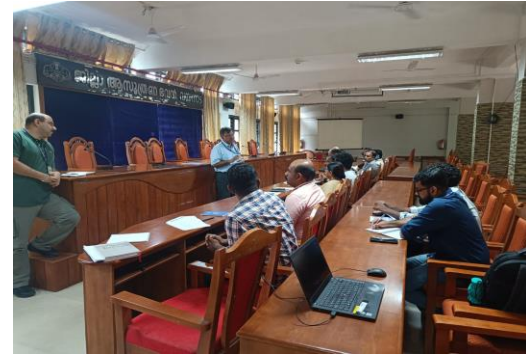
IAG, UNICEF, and Sphere India Discussing Emerging needs with Line department officials