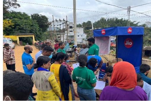
Reliance Foundation Providing assistance