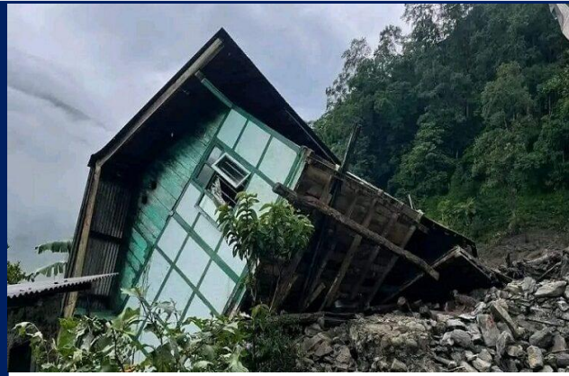
Damaged Houses North Sikkim