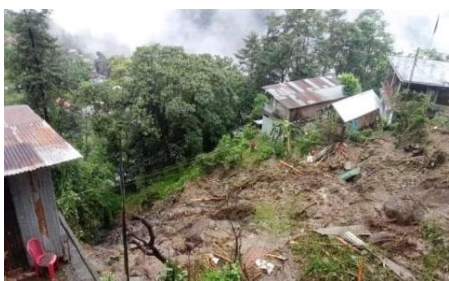
Damaged and muddy road due to a landslide triggered by a flash flood in North Sikkim