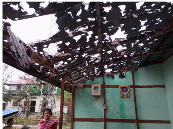
Impact of Hailstorm