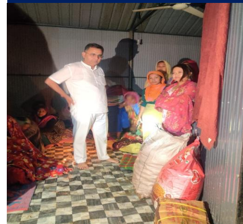
Add. Chief Secretary providing relief material in Imphal