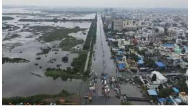
FIGURE 1: AREAL VIEW OF WATERLOGGING IN CHENNAI

The development of Cyclone Michaung, the fifth cyclone to manifest in the Indian Ocean this year and the fourth to originate in the Bay of Bengal, has precipitated a series of impactful events in the southern regions of India. The India Meteorological Department initially forecasted the development of Cyclone Michaung in the Southwest Bay of Bengal on Sunday, December 3, with a projected landfall along the coast of Andhra Pradesh by December 5.