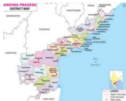
FIGURE 4: ANDHRA PRADESH DISTRICT MAP

According to the 2011 Census, it is the eighth-largest state with an area of 1,62,970 sq. km and the tenth most populous state with a population of 495.77 lakhs. The state features diverse physiographic elements, including the Eastern Ghats, Nallamala Forest, Coastal plains, and the deltas of the two major rivers, the Krishna and the Godavari. In the interest of better administration and development, the Government of Andhra Pradesh reorganized the erstwhile 13 districts into 26 districts, effective from April 4, 2022, as published in AP Gazette No. 472, dated April 3, 2022. These districts are divided into three regions: North Coastal, South Coastal, and Rayalaseema. The state comprises 13,385 Gram Panchayats in 686 Mandals, 16 Municipal Corporations, 77 Municipalities, and 27 Nagar Panchayats. Visakhapatnam, Vijayawada, and Guntur are the three largest cities in Andhra Pradesh.