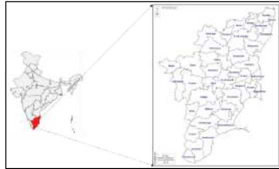
FIGURE 3: TAMIL NADU LOCATION MAP

The State of Tamil Nadu is situated in the southernmost part of the Indian Peninsula between the northern latitudes of 8°05' and 13°35' and the eastern longitudes of 76°15' and 80°20'. It is bordered by the Union Territory of Puducherry and the States of Kerala, Karnataka, and Andhra Pradesh.