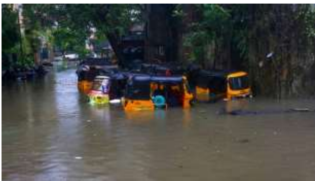
FIGURE 2: WATER LOGGING IN ANDHRA PRADESH

The cyclone's impact became evident on the night of December 3 and December 4 when heavy rains hit the coast of Tamil Nadu, leading to extensive flooding in various areas of Chennai. The cyclonic storm made landfall in the afternoon on December 5 in Bapatla between Nellore and Machilipatnam in Andhra Pradesh. It had earlier impacted Chennai and the adjacent areas of Tamil Nadu with maximum force on December 4. Heavy rainfall in northern districts of Tamil Nadu, including Chennai, caused road inundation and disruptions in daily life. Chennai reported 17 casualties due to rain-related incidents, prompting the closure of the airport on December 4 after a submerged runway. Operations resumed at 9 am on December 5. Regrettably, seventeen lives were lost in diverse rain-related incidents in and around Chennai, necessitating active rescue efforts by personnel utilizing fishing boats and farm tractors.