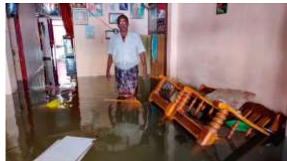
FIGURE 5: SITUATION IN CYCLONE AFFECTED AREAS