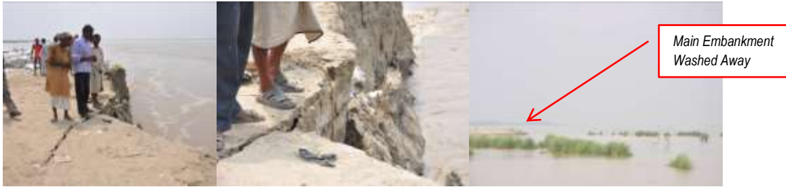
Main Embankment Washed Away