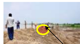
Place where breach happened

The present breach is expected to affect approximately 100,000 people in 12 villages of Sirauligauspur Tahasil of Barabanki and 1.5 lakh populations in 52 villages of Karnailganj Tahasil of Gonda district. Approximately 1500 hectares of agriculture land with standing crop have been inundated.