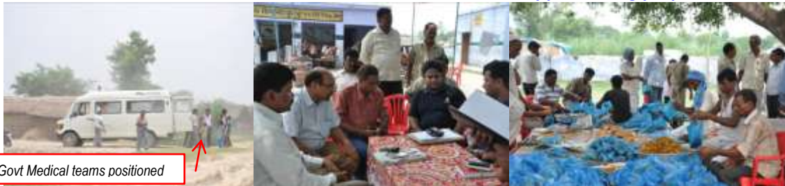
Govt Medical teams positioned