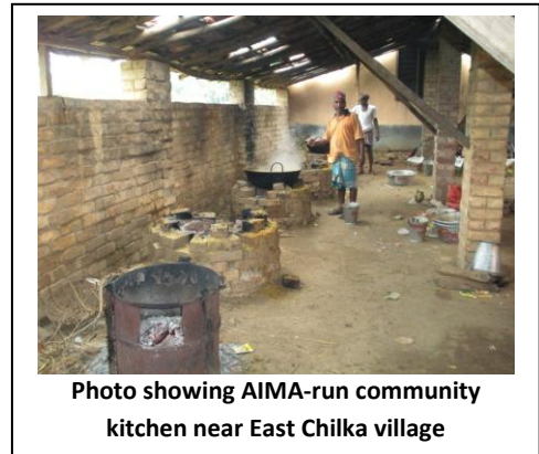
Photo showing AIMA-run community kitchen near East Chilka village