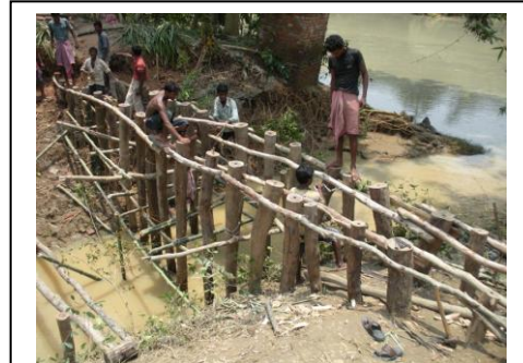
Photo showing repair of the breach in the embankment in progress in Dobandi village