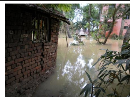
Photo showing structural damage to houses in East Chilka village