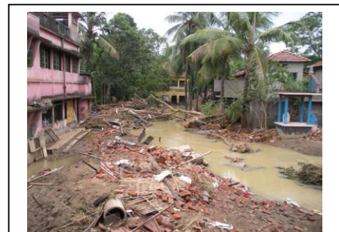
Photo showing widespread destruction due to flooding in East Chilka village

Rains have ceased in many parts of the state and there are reports of waters receding in some of the worst hit areas of the state. The situation is slowly returning to normalcy.