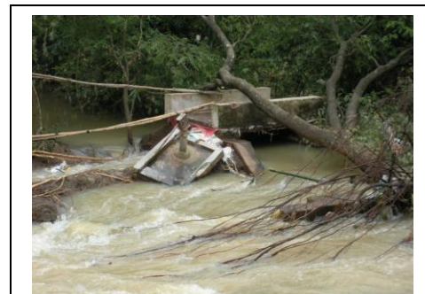
Photo showing damaged handpump at East Chilka village