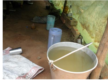
Photo showing people using highly turbid water at Dobandi village