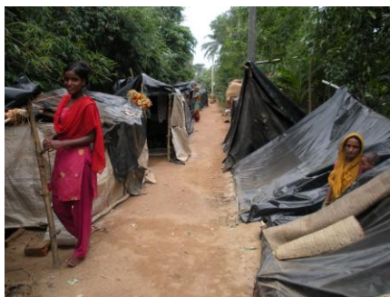
Photo showing people taking shelter on embankment at Moyna I GP